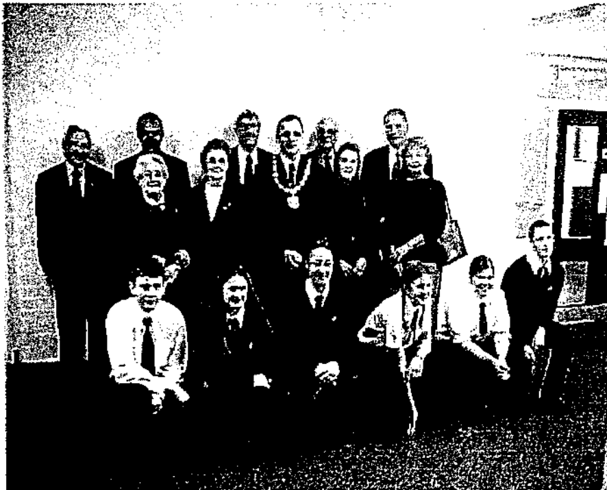
A selection of staff, pupils and members celebrate the schools birthday.