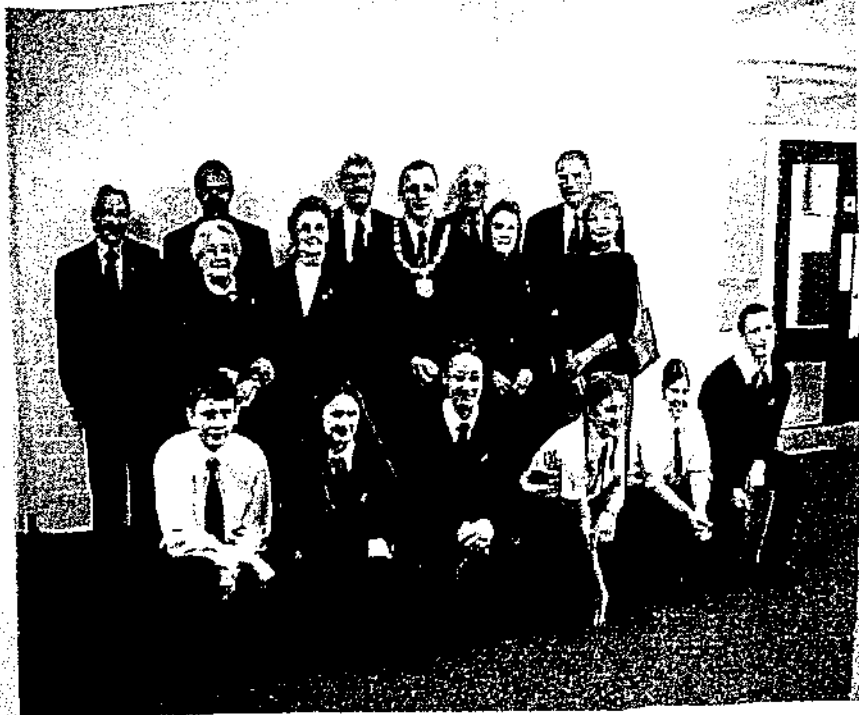
A selection of staff, pupils and members celebrate the schools birthday.